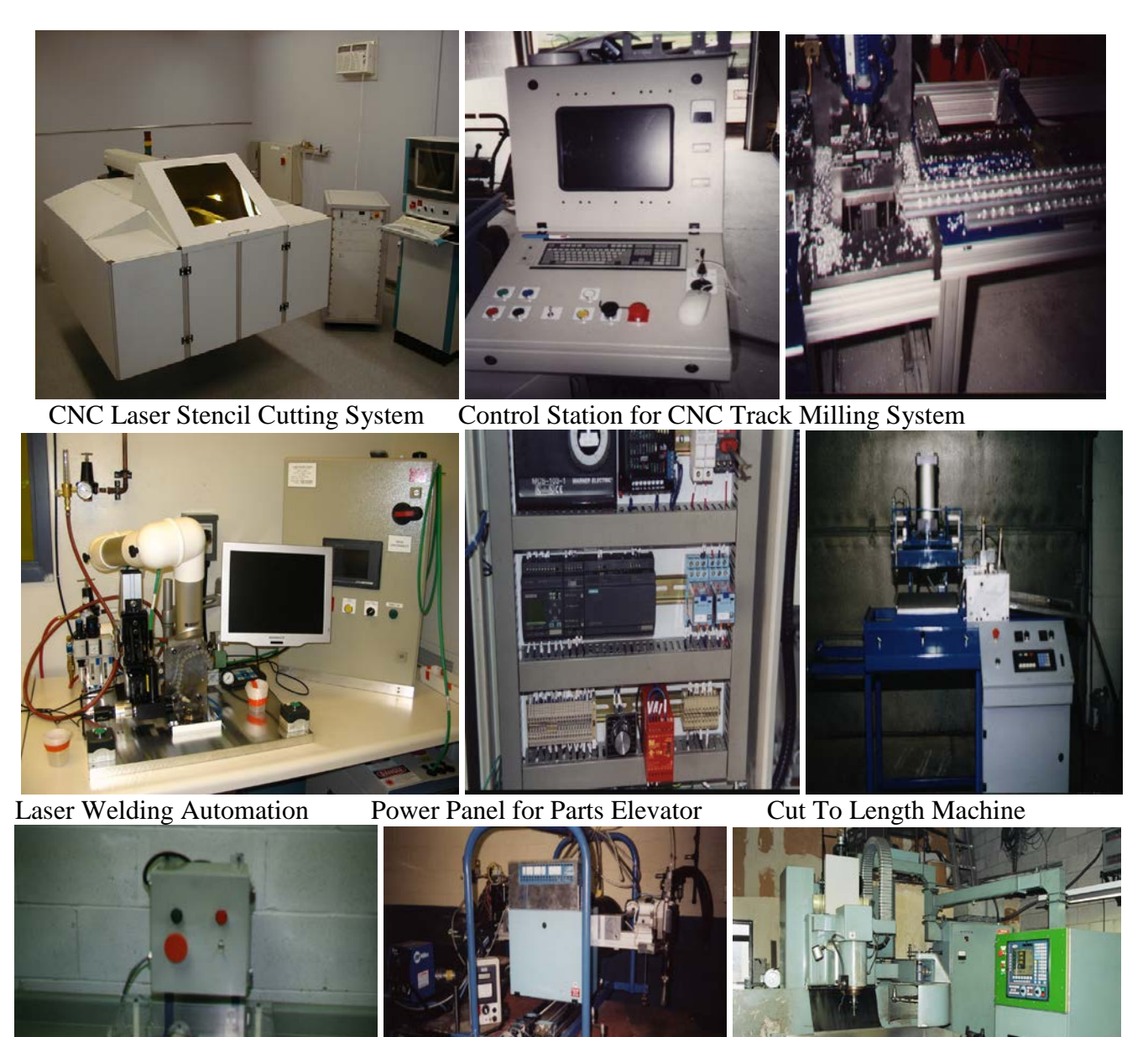
Cut To Length Machine